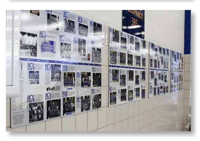
To see the entire timeline online click the photo above and use the related links.