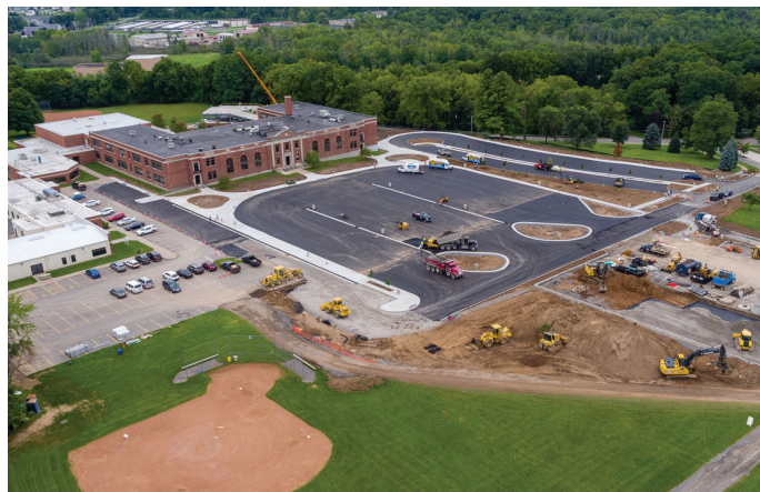
VECS Parking Lots and Bus Loop

Installation of energy performance LED lighting in all buildings has begun. Twenty percent of this campus-wide work is complete. The expected completion date for all of this work is September, 2019.