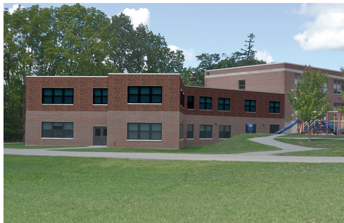
VECS Classroom Addition ~ Architect Rendering