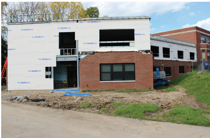
VECS Classroom Addition