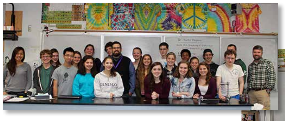
The Graduates of Distinction program was initiated in 2002 as a way to recognize VCS alumni who have demonstrated outstanding achievement and made significant contributions to society.