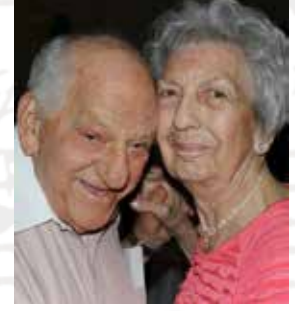
Presented by VICTOR CENTRAL SCHOOLS Office of School & Community Relations and the Senior High Key Club